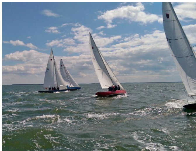
Final day of the Shields Early Spring Series, Non-Spinnaker racing May 7 th