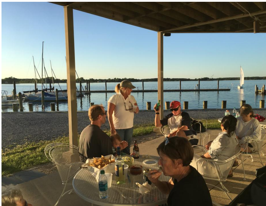
FOS Sailors, after a beautiful night of racing!